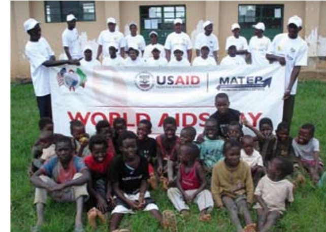
World Aids Day