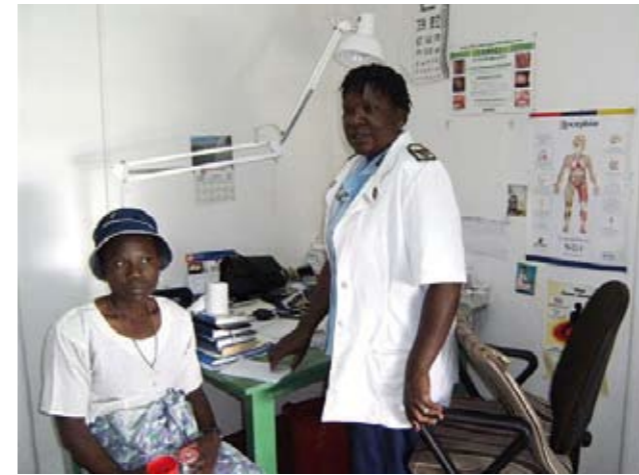
Medical health care