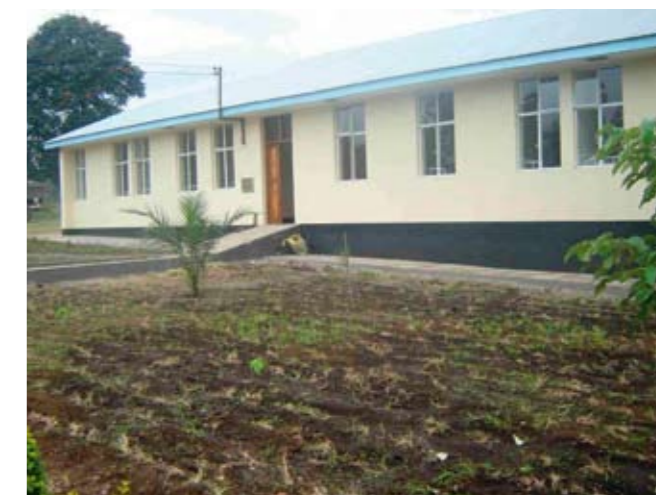
Renovated Tengeru hospital female ward