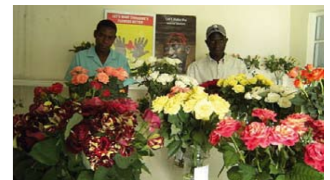
The blossom test