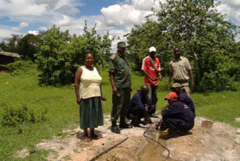
Bore hole Chalimbana Police