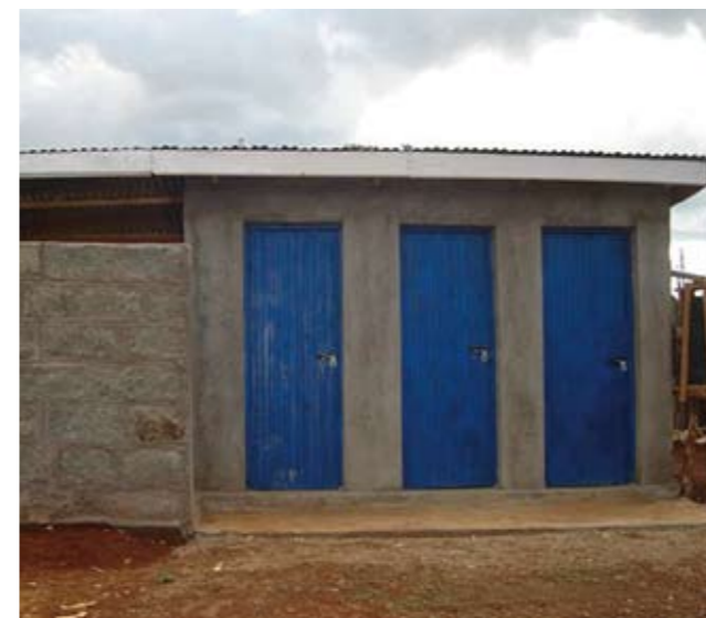
Toilets at Liki Kindergarten