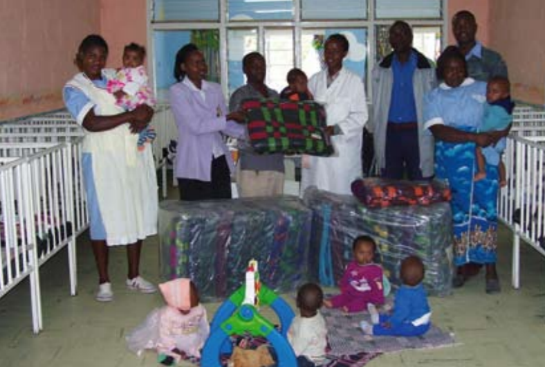
Chrèche - Oserian