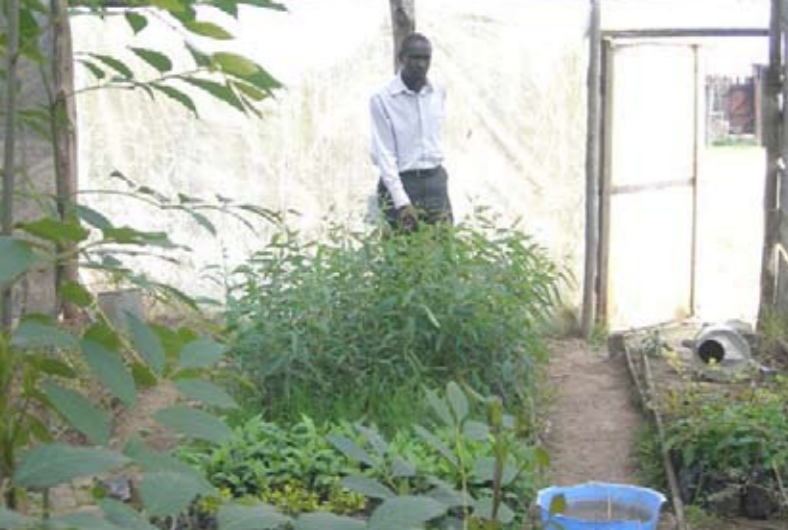
Maria Gorret nursery