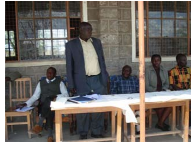
Skills training project for workers