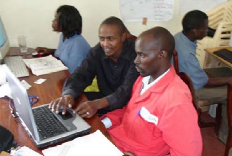
Computer course for Waridi employees