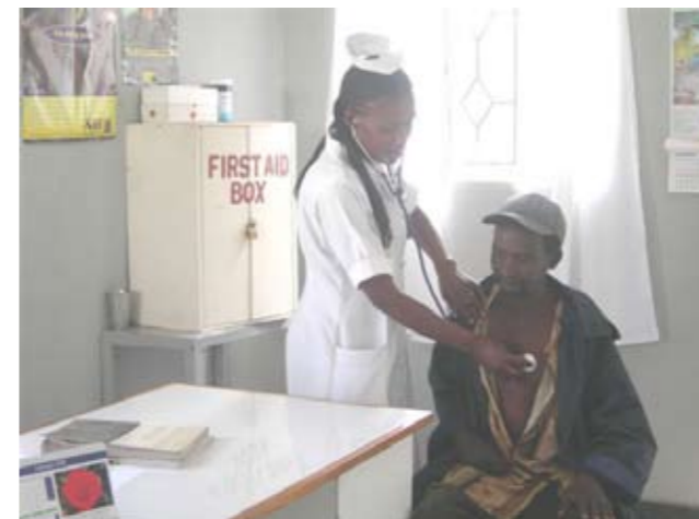
Medical health care