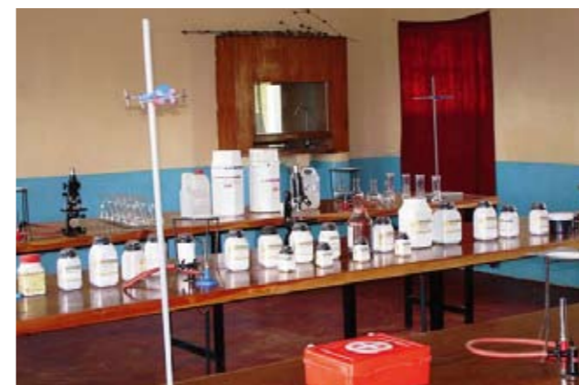
Refurbished Laboratory and items donated to Secondary schools