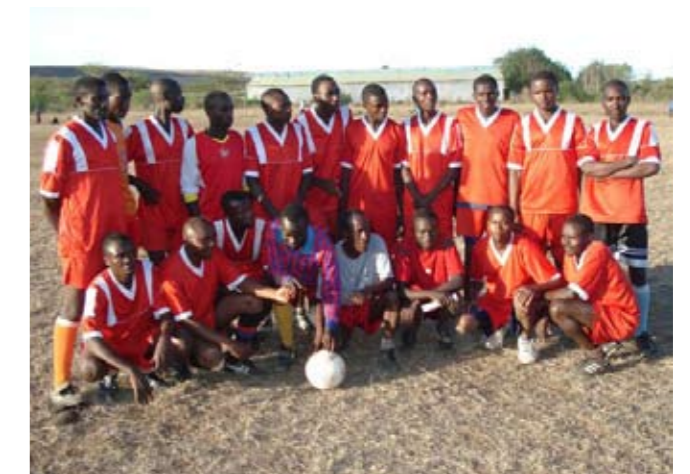
Waridi sports projects