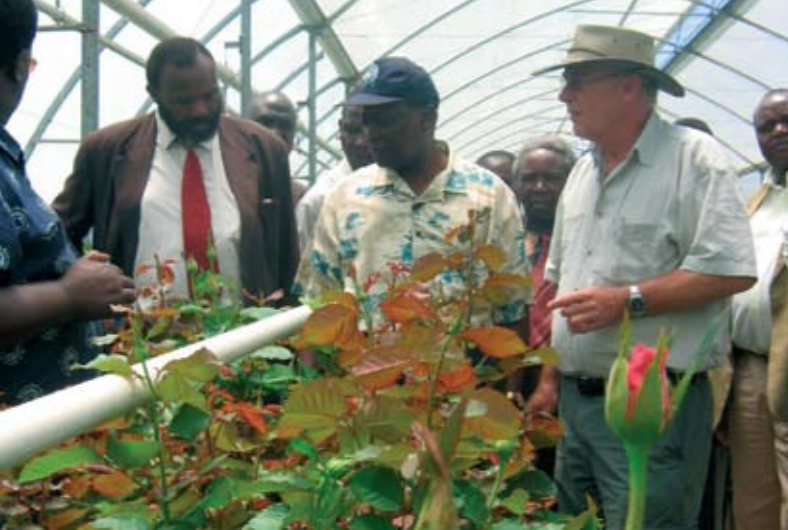
Visit MP Roses Greenhouse